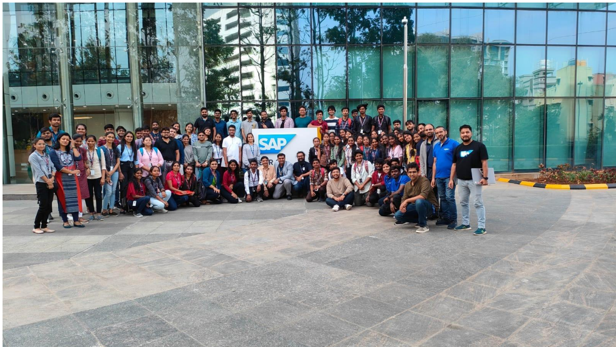
Industrial Visit to SAP Labs